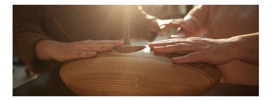
Fig. 3b: A closed circuit is being formed when users place one hand on the touchpad of the Crdl and touch each other.