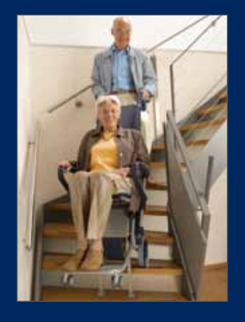
Escalino also masters winding stairs safely and comfortably.

This innovative climbing aid overcomes stairs practically all by itself. The climbers provide steady and secure footing and do not damage the edges of steps. At a standstill and slightly extended climbers the device's seat is lifted so you can easily get on or off it. Thanks to its big wheels and climbers the escalino can also be used on grating stairs.