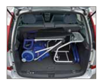
The escalino is disassembled in no time at all and fits into the boot of your car.

Handling the escalino is particularly easy. When we developed the device we concentrated, among other things, on compact measurements and easy handling.