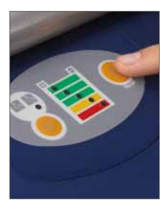
The escalino's control unit is clearly structured.