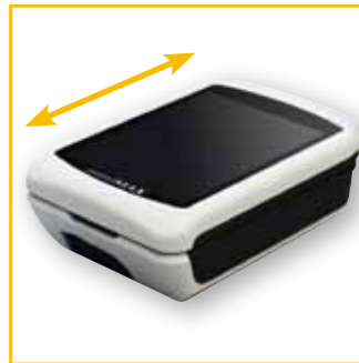
Switch on by pushing sideways

letters, crosswords, transferals, holiday postcards