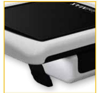
Mini fold-out stand for writing