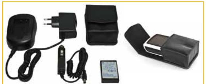
additional accessories are available

Reinecker Reha-Technik GmbH Head office Germany Development, production, sales, customer service and after-sales service