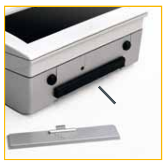
replaceable rechargeable lithium-ion battery