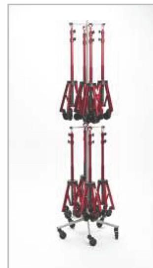
2-level rack with eight VIOLETTAS

Accessories ART No Handle 080-3003 Extra hooks, pair 080-3004 2-level rack, for 16 VIOLETTAS 080-3005 1-level rack, for 8 VIOLETTAS 080-3006