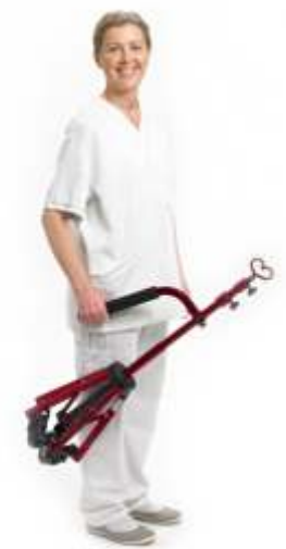
Light to carry

VIOLETTA is now also available in a 2-sectioned version (not shown in picture).