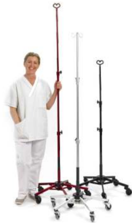
Stable and functional

How do you store 16 IV stands on less than 0.5 m 2 ? How do you carry IV stands easily, for efficient mobile care ?