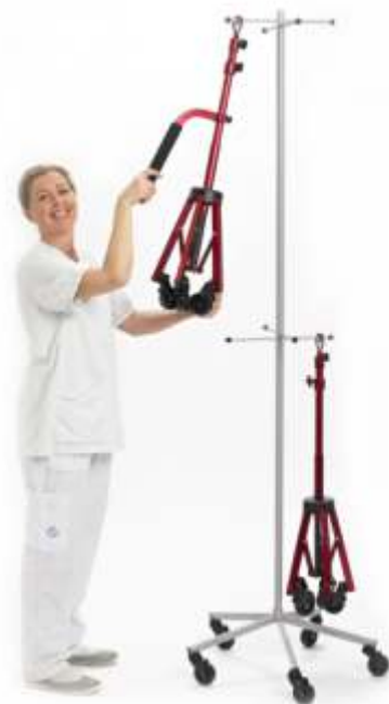
Practical to store

VIOLETTA is a truly new innovation that will change how you think of IV stands.