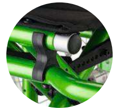
A seat that grows with the user