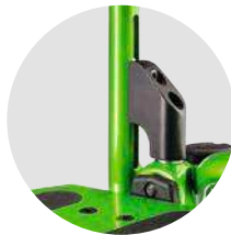
Infinitely variable adjustment of lower leg length from 200 mm up