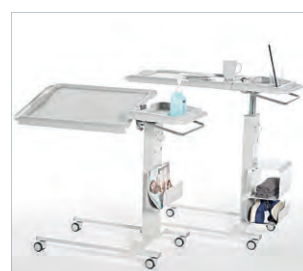
Overchair tables BT and BT plus