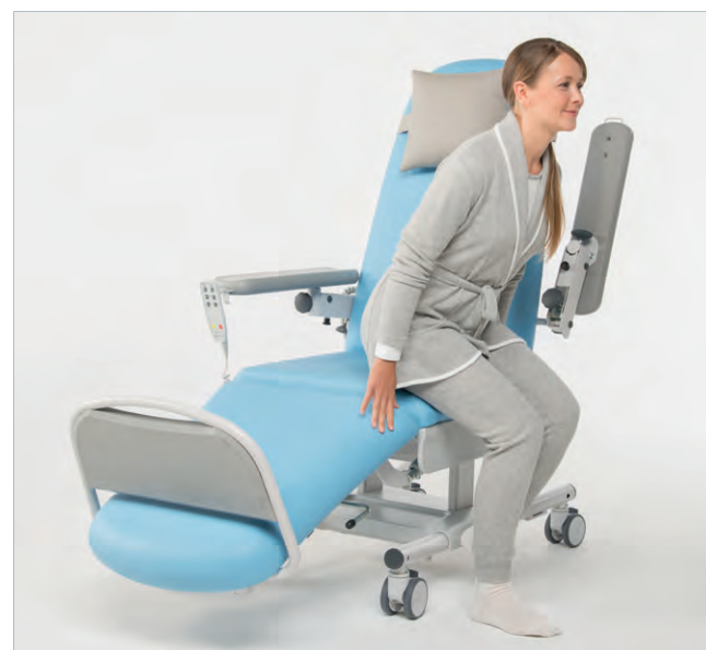
Low access heights from 54 cm, depending on model

GREINER produces treatment couches tailored to your precise needs. You choose the covers and cushions individually. Premium covering materials and upholstery offer extra-soft, wear-resistant surfaces; a dynamically flexible suspension system in the seat section supports freedom of movement for the spine, pelvis and hips, thus relieving pressure to the benefit of patients. Innovative MULTILINE five-position armrests, the first to move in five directions, are also setting new standards. The overchair tables BT and BT plus ensure that the focus is firmly on patient comfort.