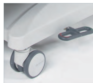
Central braking system