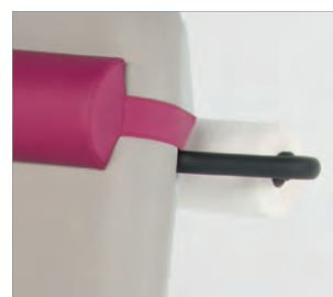
Handle with paper roll holder