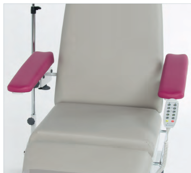
Five-position padded armrests with attached remote control