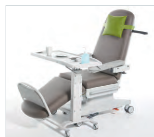
High comfort with BT overchair table