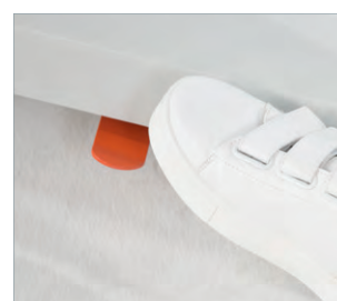
Emergency foot switch