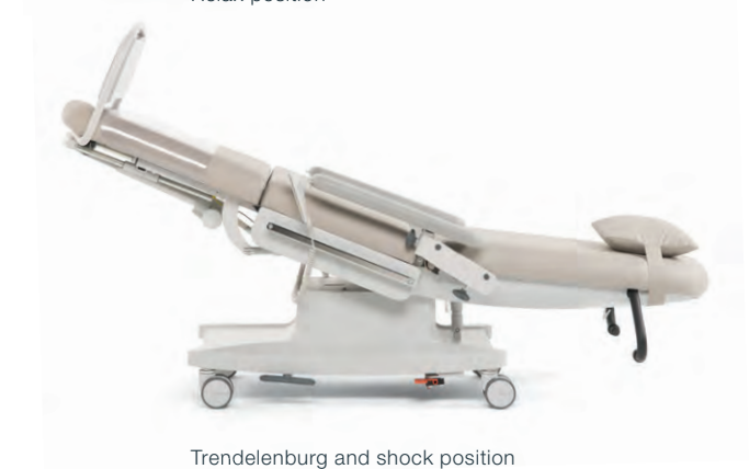
Trendelenburg and shock position

GREINER hand control unit with intelligent operation: simple, internationally understandable symbols; keys for basic settings for seated, relaxation, flat bed and Trendelenburg positions are easily accessed in an emergency; adjustable height and footrest. Safety is assured thanks to a magnetic key lock.