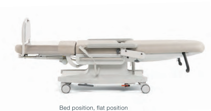
Bed position, flat position