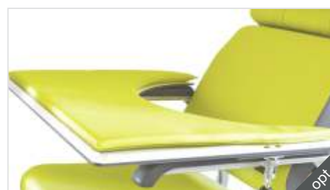
table with u-pad (optional)