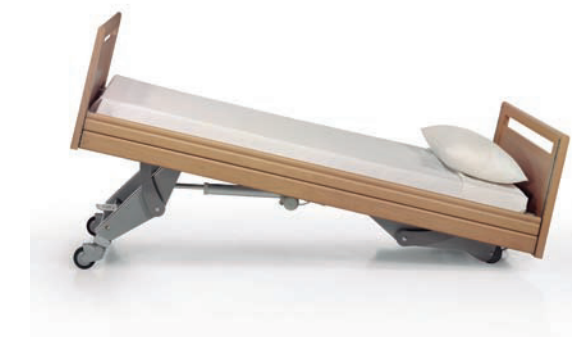
Reverse trendelenburg \pm 16^\circ

Reduces physical effort needed to move patients.