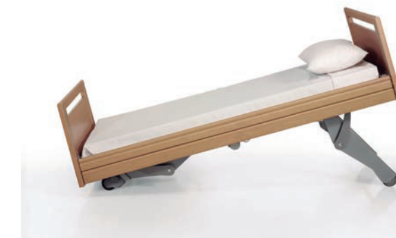
Trendelenburg \pm 16^\circ

Our high quality products, reduce time for cleaning up to 30%. Smooth surfaces and detachable panels allow a quick and easy cleaning and disinfection.