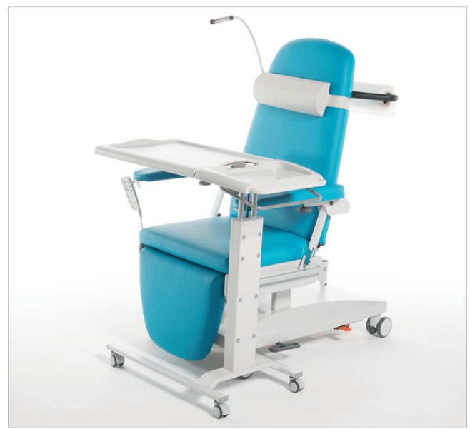
Perfect for combining with the MULTILINE NEXT DC and IT (IT shown here)