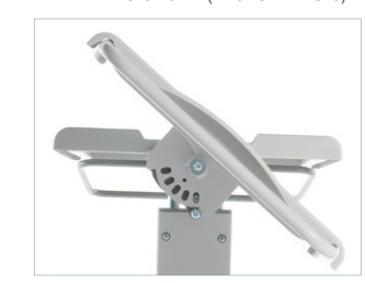
Swivelling tray (BT plus)