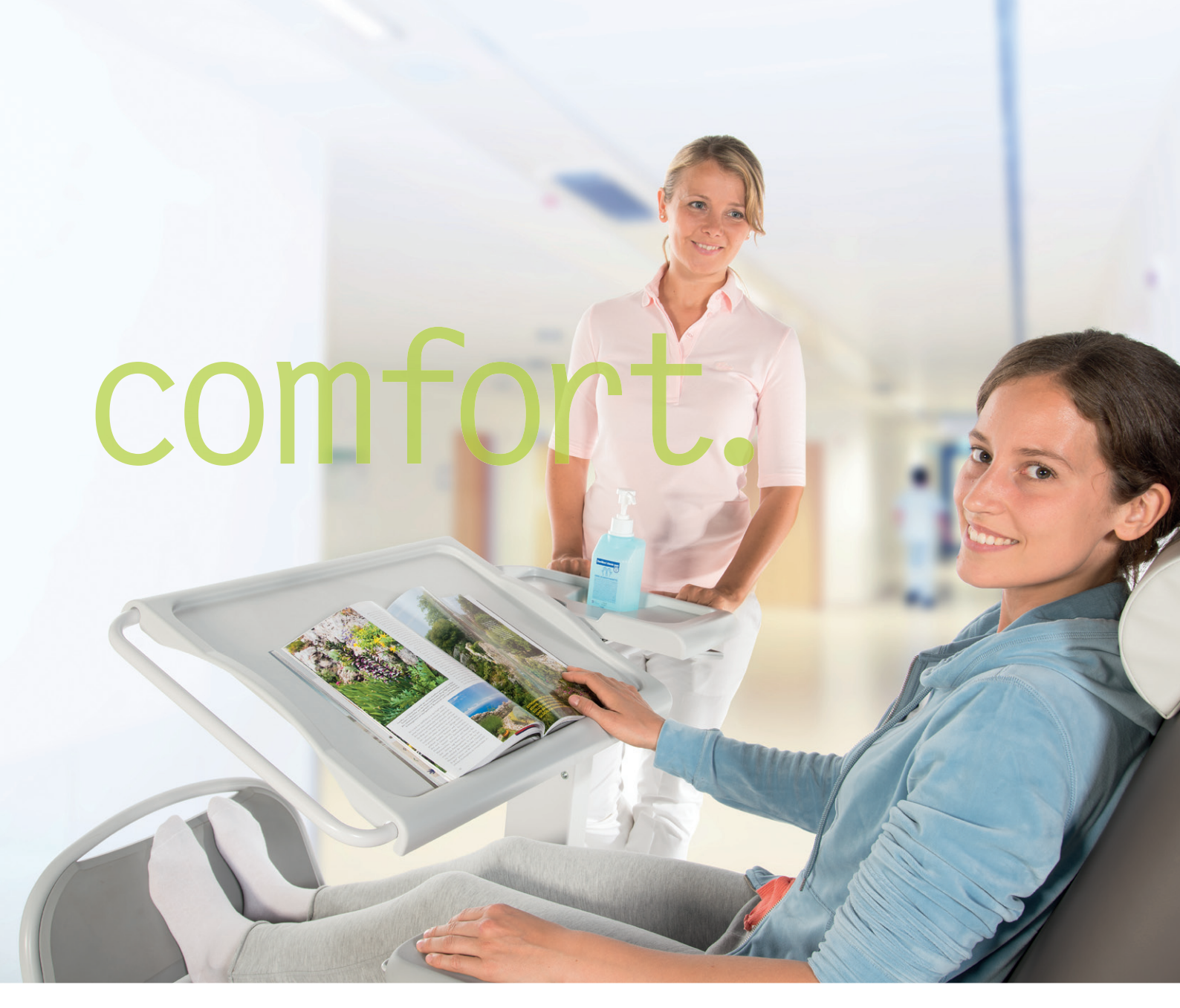
MULTILINE NEXT BT AND BT PLUS. OVERCHAIR TABLES.