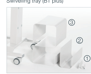
Multipurpose accessories, see table

The epitome of functionality, ergonomics, stability and hygiene, the new overchair tables have been meticulously designed to ensure they meet the most stringent requirements of patients and nurses alike. The sturdy frame in typical GREINER quality is combined with smooth-running castors to ensure the table is easy to move while still safely holding loads of up to 30 kilos. Powerful pneumatic springs make it easy to gently adjust the height of the tray with one hand – and provides added safety if the patient is in the emergency Trendelenburg position. On the BT plus the tray can be tilted at the touch of a button so that it is ergonomically positioned for both patient and nurse. The removable trays have recessed grips and are the perfect size for holding meal trays, patient items, clinical accessories and disinfectants. The tough, resistant surfaces are quick and easy to clean and disinfect. A range of accessories are also available to improve the patient experience still further.