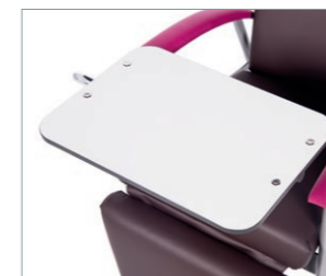
Patient table detachable and movable, at right hand side