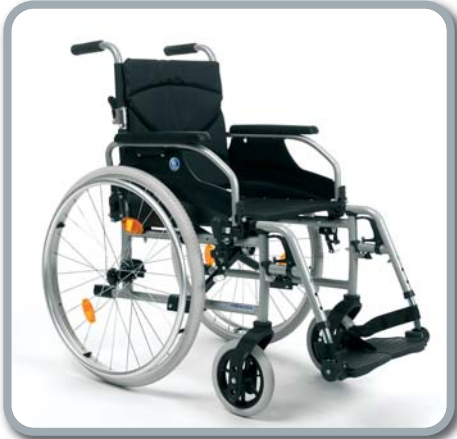
Model D200 and D100 are also available with an optional B69 (foldable) backrest

The D200 is your ideal hybrid lightweight aluminum wheelchair. Completely foldable and lots of adjustment possibilities, including the footplates which can be adjusted in angle.