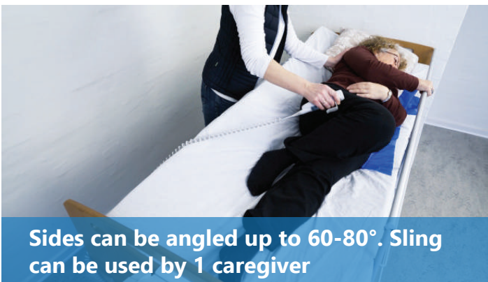
Sides can be angled up to 60-80°. Sling can be used by 1 caregiver