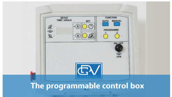
The programmable control box