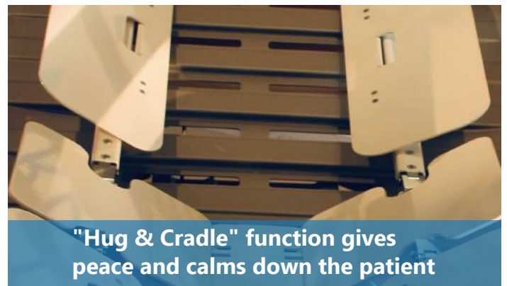
"Hug & Cradle" function gives peace and calms down the patient