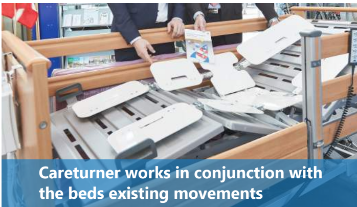
Careturner works in conjunction with the beds existing movements