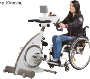
Kinetec Kinevia Duo™

Both Kinevia Duo™ (arms + leg) and Kinevia™ (legs only) come with a number of innovative specifications. From the tool-free adjustment coming as standard or the premium wheels with ball bearing easing transport to the 5-year warranty extension on all mechanical parts our units offer a premium user experience at all levels.