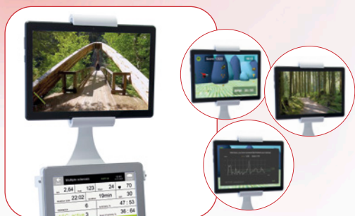
KINEVIA ENTERTAINMENT SYSTEM