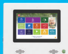
Smart Console (10.1" TFT LCD)