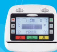
Standard Console (9" LCD)