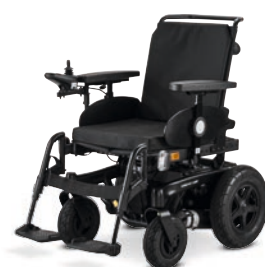
iCHAIR MC BASIC