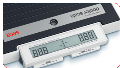
The two buttons on the front side of the scale can be easily operated by foot.

You can also access the website via this QR code: