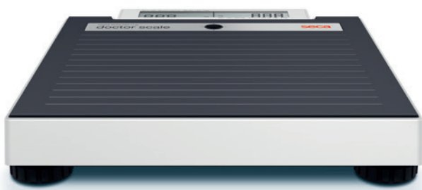
The flat construction and non-slip tread make it stable and comfortable to step onto.

A good name is earned through quality and modern functionality. That is why the seca 878 dr has been labeled the "doctor scale". It indicates the value of the product while reflecting the professionalism of the user. The label gives users certainty about the precision of the measured values and can be exchanged for personalized messages. Further information can be found at www.seca.com/doctorscale .