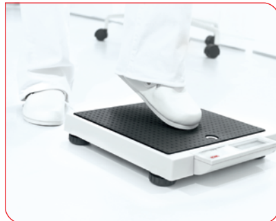
Tip-on function for weighing without turning on the scales.