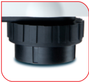
Large leveling base on the bottom of the scale for safe placement.