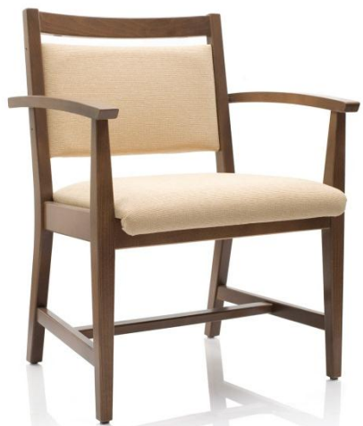
The belsedia „big“ bariatric chair Mod.-No. 60-0195