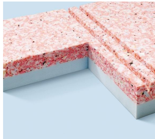
HeavyMatt 200 mattress Height 18 cm Mod.-No. 50-0316