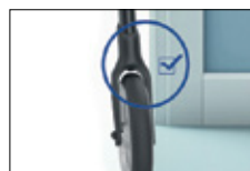
Integrated wheel fork