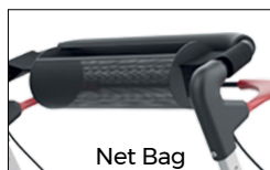
Accessory bag for utensils such as medicines and cosmetics