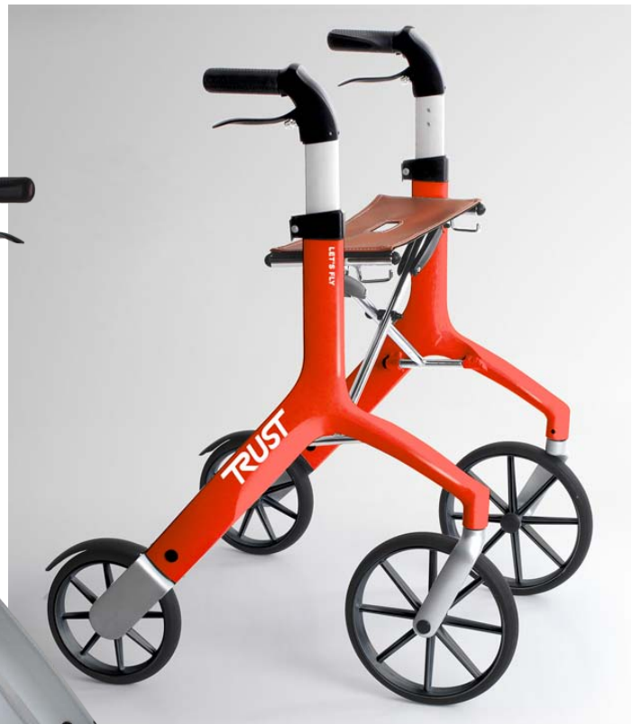
Let's Fly Red with Brown Seat