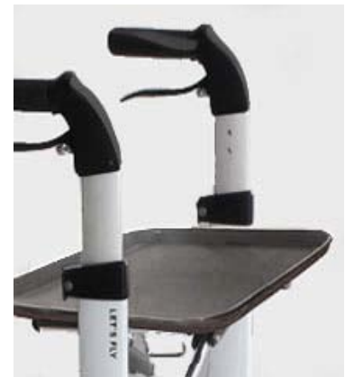
Black Plastic Tray