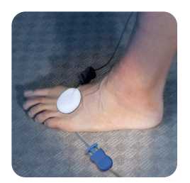
Pain in Top of Foot. Second Pad on Bottom of Foot Opposite Pad on Top (e.g. Metatarsal or Neuroma Pain)