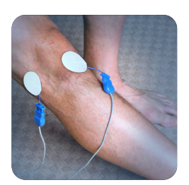
Pain in Back Side of Knee (e.g. PCL Sprain) Quick Reference Guide | 8