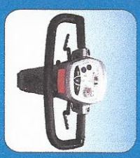
Delta Handle Bar