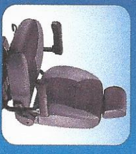
22" Captains Seat