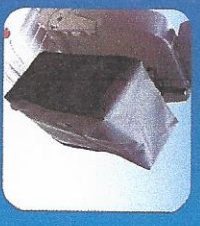
Rear Bag W/ Crutch Holder