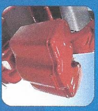
Color Matched Locking Cargo Compartment