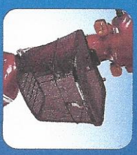
Front Basket With Lid