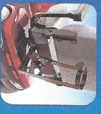
Oxygen Tank Holder