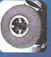
Flat Free Tire