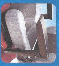
Height And Width Adjustable Armrest