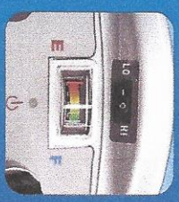
H/L/O Speed Switch (HS-517/8 Series Only)