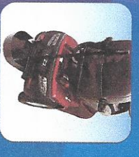
Golf Bag Holder