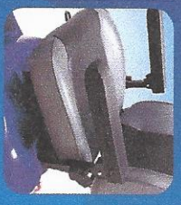
Height And Width Adjustable Armrest