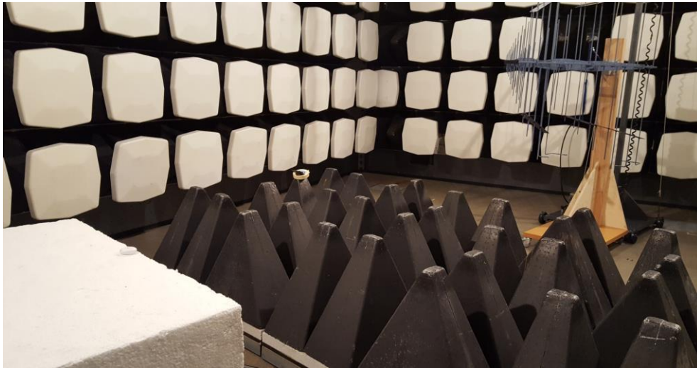
Photo 4. Radio frequency electromagnetic field test setup. 80 MHz – 1000 MHz.