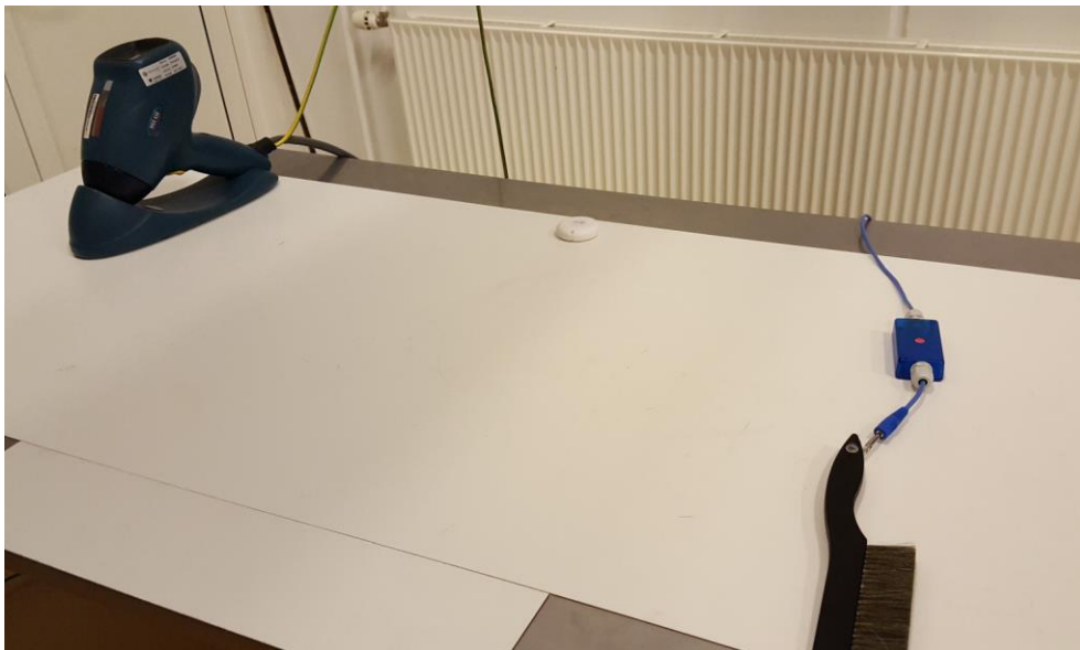
Photo 6. Electrostatic discharge test setup.

Functional tests were performed before, during and after testing.