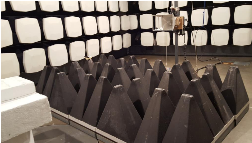
Photo 5. Radio frequency electromagnetic field test setup. 1.0 GHz – 6.0 GHz.