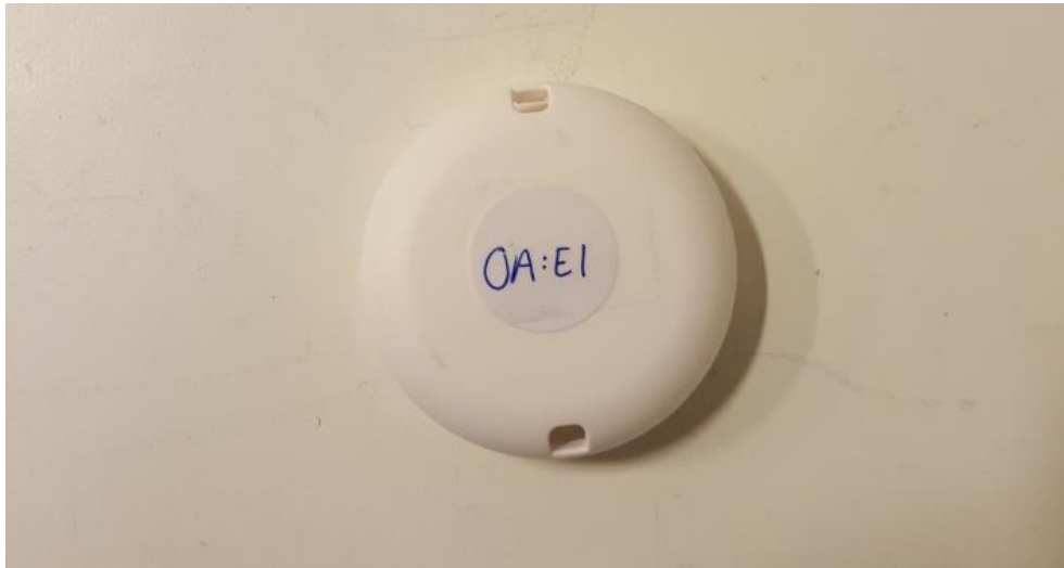
Photo 7. Discharge points for electrostatic discharge tests.

Air discharges were not possible at any of the non-conductive parts of the test specimen at any of the test levels.