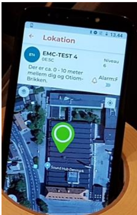
Photo 3. Smartphone to monitor BLE performance.