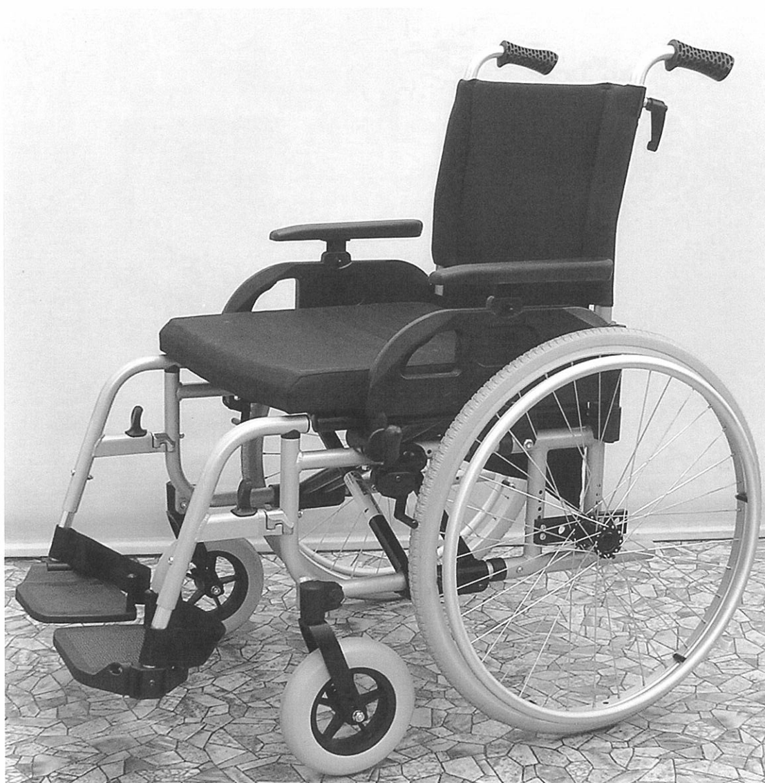
PHOTO OF WHEELCHAIR