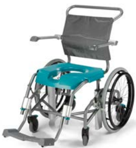
Easy STD Wheels and hand rims