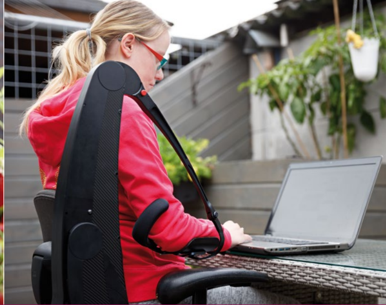
• Gowling makes the arm float over the keyboard

3. Persons in the need of redistribution of pressure/ forces who feel the need to execute such essential manual tasks.