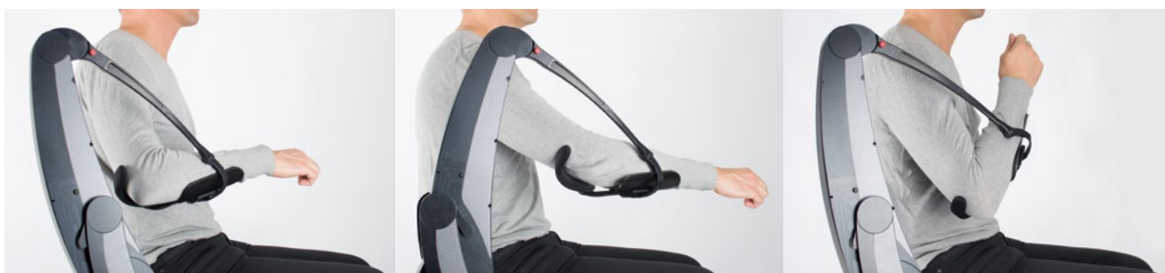
• Large horizontal movements, combined with easy and quick reach of the mouth and face