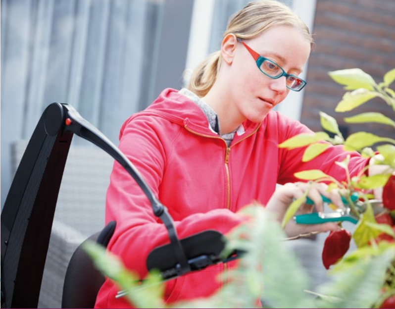
• Gowling can be used both indoors and outdoors