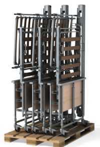
3 beds on a pallet of 120x80 cm