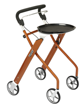
Sunset Art. No. LD501