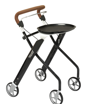
Black Swan Art. No. LD502

The handles are clad with soft foam rubber, adjustable in height to fit different statures. The brake can easily be operated with only one hand and is active on both rear wheels. The rollator also has of course a parking brake. It can be easily folded and can stand alone when it is folded.