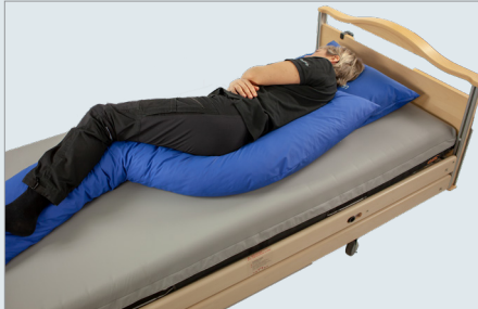
30° position for pressure relief