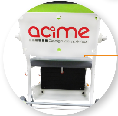
Document and belongings holder included as a standard