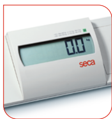
The patient's BMI can be determined when his height is entered.

The low platform profile reduces patient effort and risk when stepping on the scale. As the 22 x 22 inch platform is almost twice as large as that of a normal scale, a chair may also be placed on the scale for weighing a patient. With the pre-TARE function, the weight of a chair or standing aid can simply be tared away. Up to 3 TARE weights (e.g. chair weights) can be stored.