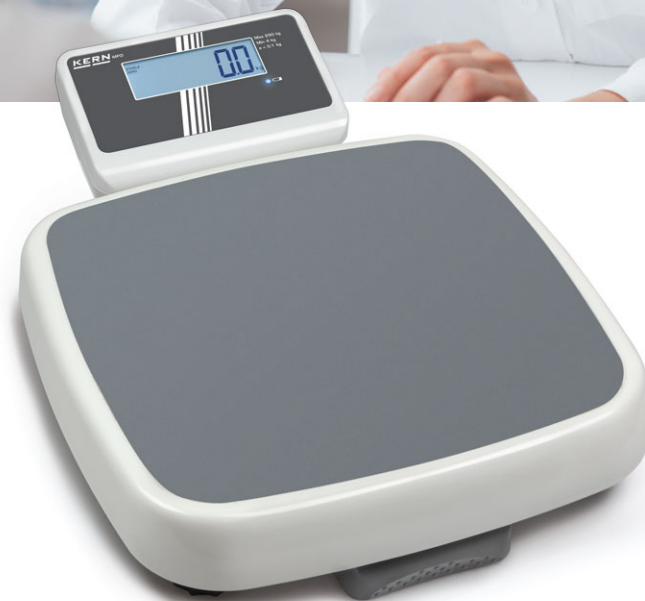
KERN MPD 250K100M