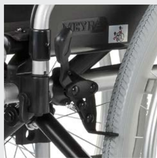
Knee lever brake