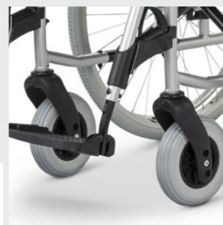
Front seat height-adjustable without swapping parts