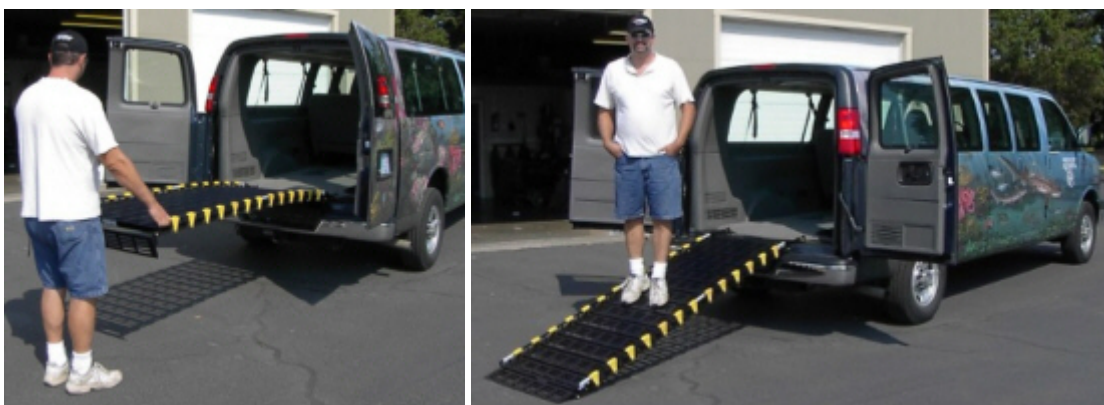
Used for delivery vans by many satisfied customers