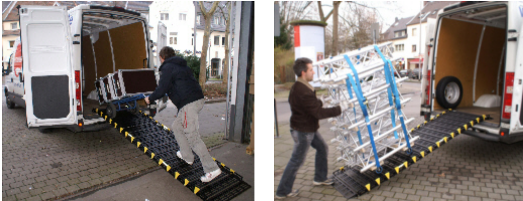
Used in the stage sound and lighting industry worldwide (seen here in Germany)

Fabricated of strong anodized aerospace aluminum, Roll-A-Ramp holds up to 2,000 pounds of evenly distributed weight!