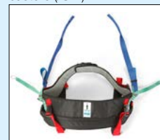
Gait training Kit Multi The MULTI gait training kit converts the stand-up harness into a gait training harness.