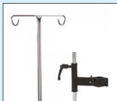
Drip rod complete with attachment