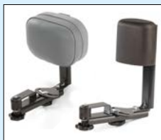
Side support/Side support PU