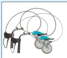
Handbrake kit DB