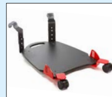
Platform, short/long, castors (/SW)