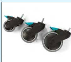
Castor with brake 75, 100, 125 mm