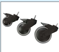
Castor with directional locking 75, 100, 125 mm