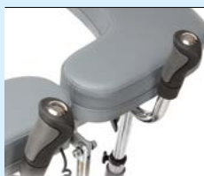
Control/handle - push button switch