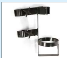
Tube holder incl bracket