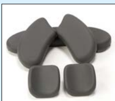
Armrest cushions/shin supports, PU