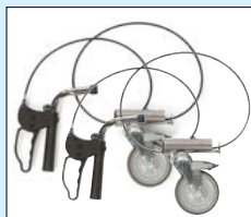
Handbrake kit standard