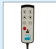
Hand controller PLUS