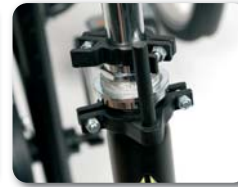
D1 - Steering limiter