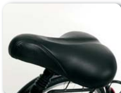
E12 - Comfort saddle PU + plastic