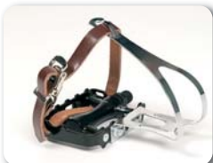
F2 - Pedals with toes clip & strap