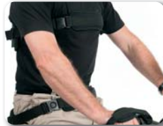
P3 - Pelvic and back support