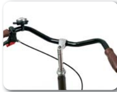
S3 - City steering