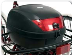
E5 - Lockable topcase volume: 30 liter