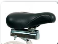
P4 - Adjustable saddle (140 mm)