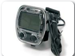
E3 - Odometer (batteries included)