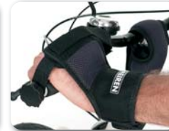
E10 - Hands holder with straps