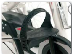
F1 - Pedals with strap