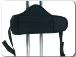
P1 - Pelvic support