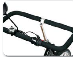
S4 - Rectangular steering