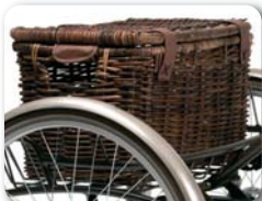
E4 - Vintage Basket