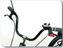
S1 - Classic steering