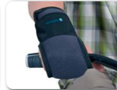
E11 - Closed hands holder