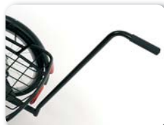
E1 - Pushing handle (335 mm or 605 mm)