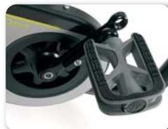
F5 - Pedals with adjustable length (22 mm)