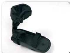
F4 - Foot support with Velcro straps & ankle support