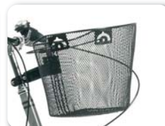
E14 - Front basket