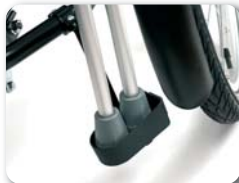
E6 - Crutch holder