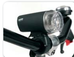
E2 - Lighting system (batteries included)