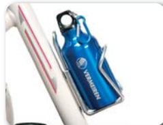
E7 - Drink holder (cannister not included)