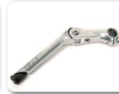
S5 - Adjustable steering bracket (-10° to +50°)