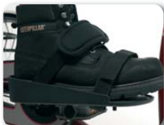
F3 - Foot support with Velcro straps