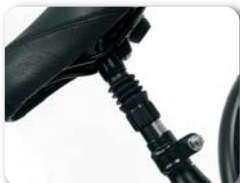
P5 - Saddle tube with shock absorber