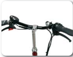
S2 - Flat steering