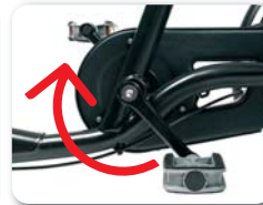
O2 - Torpedo brake