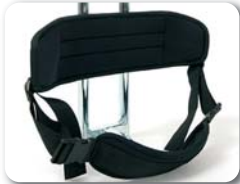
P2 - Back support