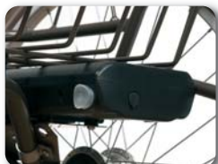
BAT 9 - BAT 13 - Extra battery E-bike (9A or 13A)