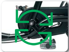
O6 - Fixed wheel