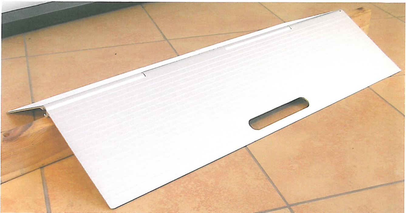
PHOTO OF PRODUCT

Technical aids for disabled persons – General requirements and test methods