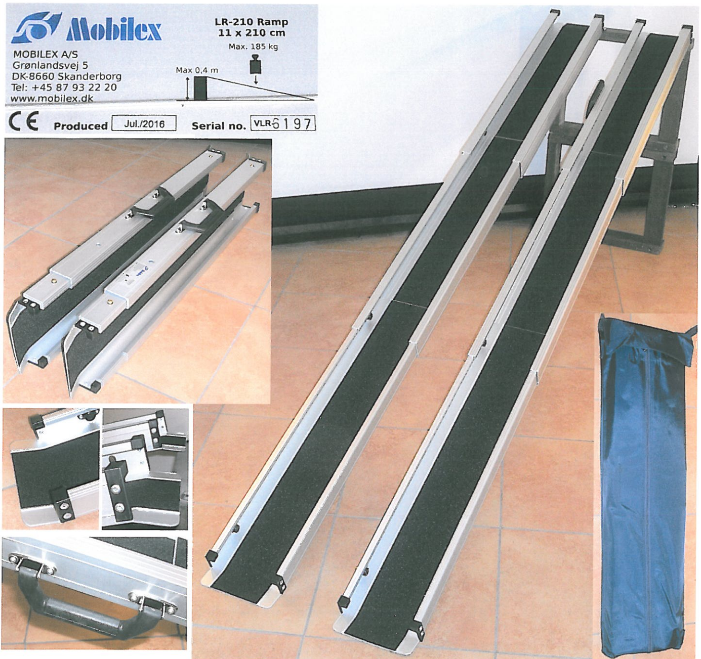
PHOTO OF PRODUCT

Technical aids for disabled persons – General requirements and test methods