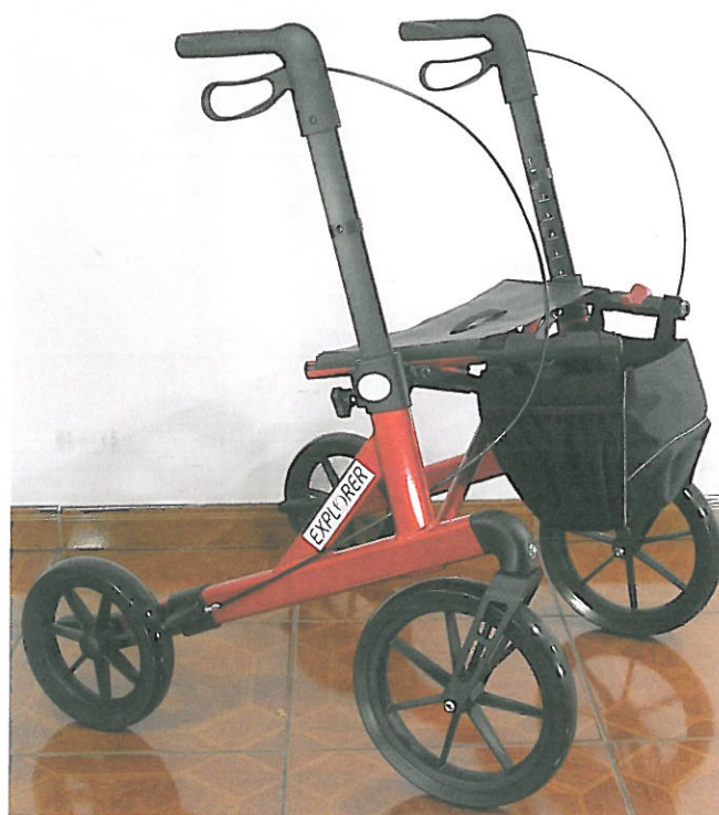
PHOTO OF PRODUCT