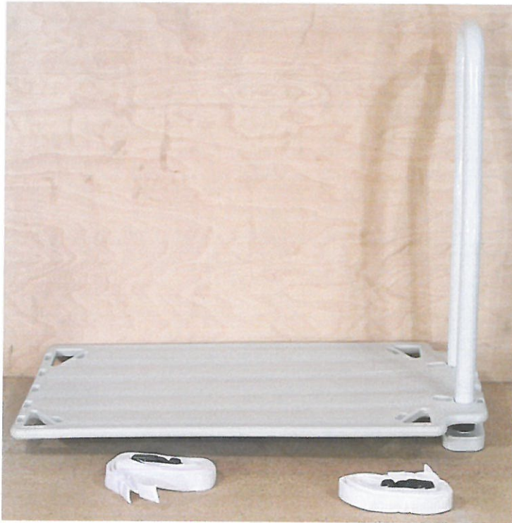
PHOTO OF PRODUCT