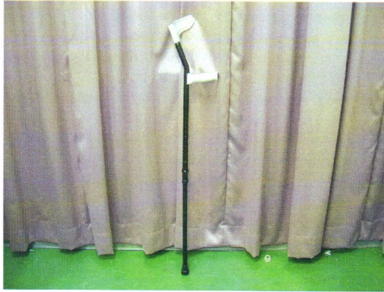
Figure 1 Appearance of the sample

Test Results: BS EN ISO 11334-1 Walking aids manipulated by one arm – Requirements and test methods – Part 1: Elbow crutches