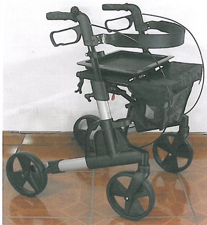
PHOTO OF PRODUCT