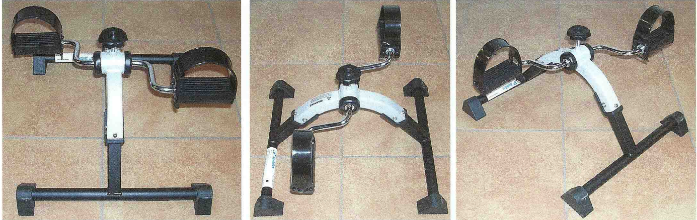
PHOTO OF PRODUCT